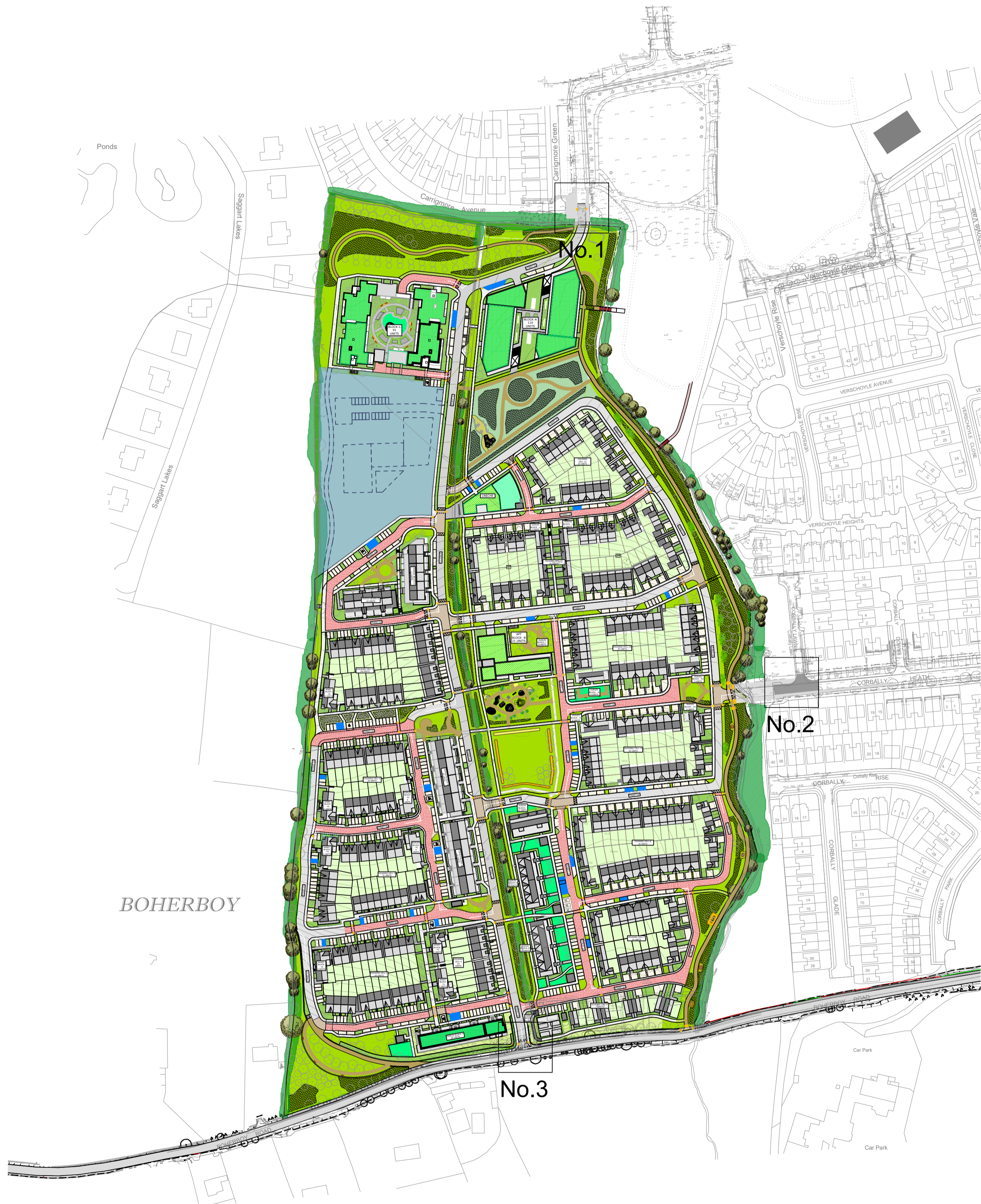
GENERAL LAYOUT SCALE 1:500